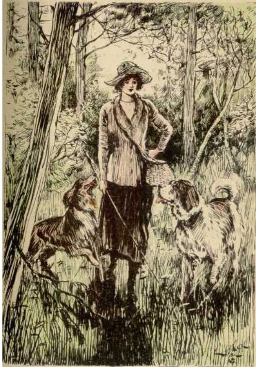
Diane swung lightly up the forest path.