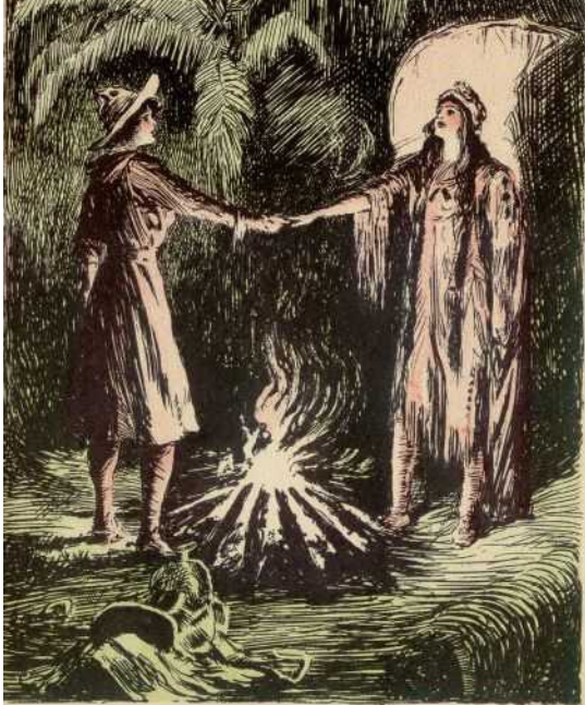
White girl and Indian maid then clasped hands.

[Illustration: White girl and Indian maid then clasped hands.]